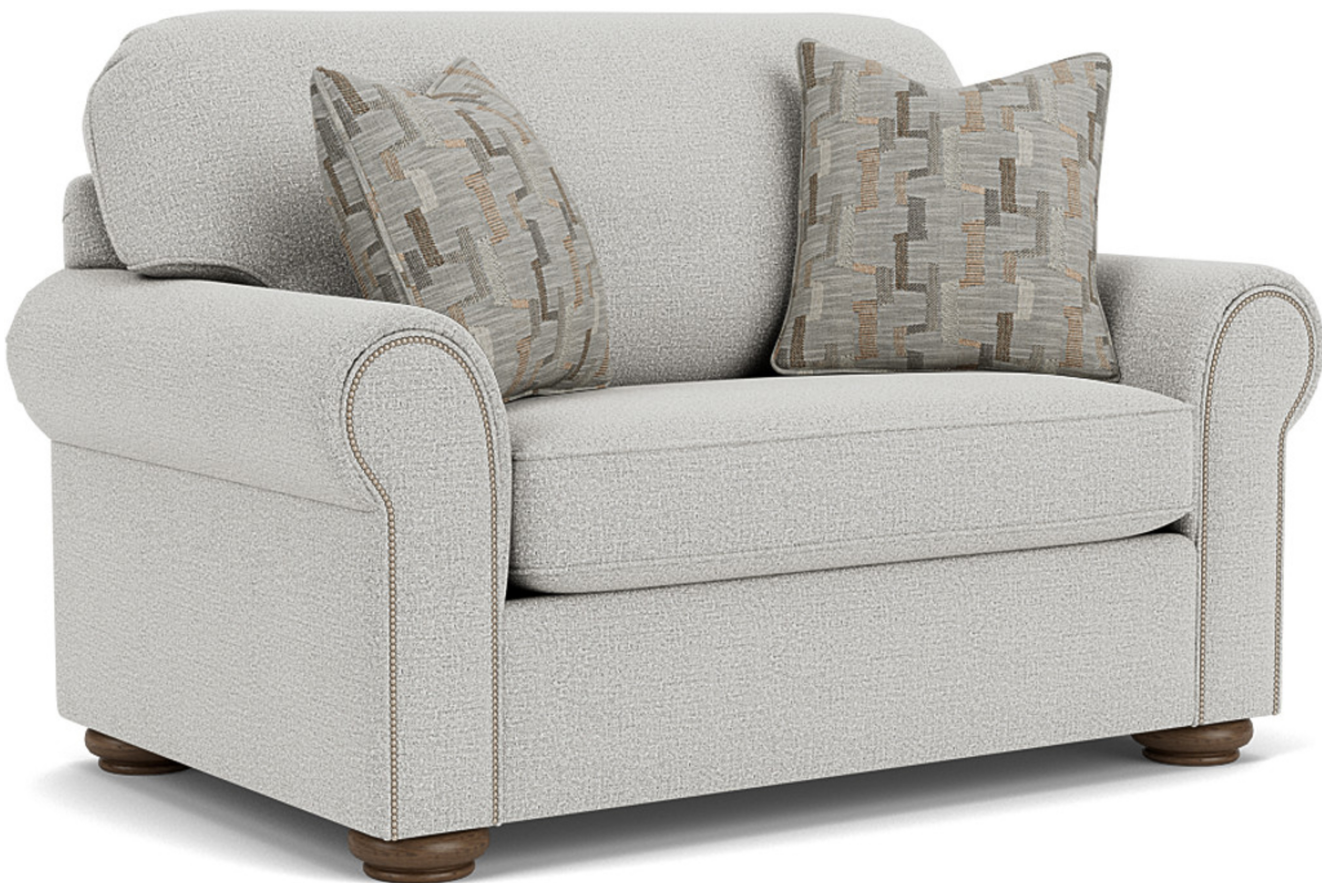
5536-41 in Fabric 962-01