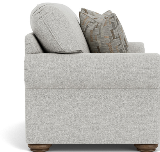
5536-41 in Fabric 962-01