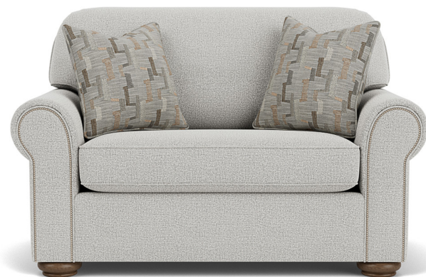
5536-41 in Fabric 962-01