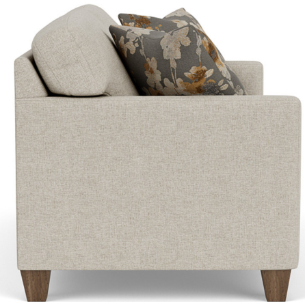
5552-43 in Fabric 818-01