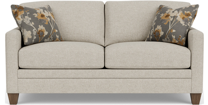
5552-43 in Fabric 818-01