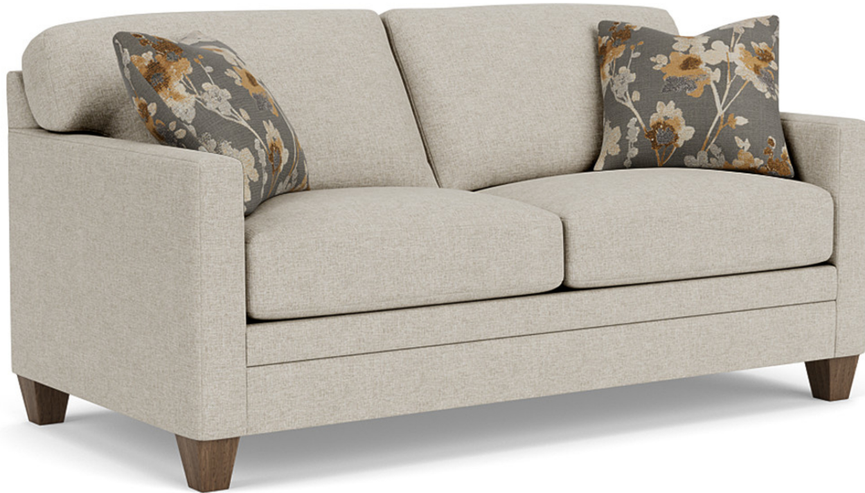
5552-43 in Fabric 818-01