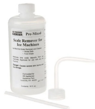
Part#19-0664 Clear One Pre-Mixed Scale Remover with Special Bottle