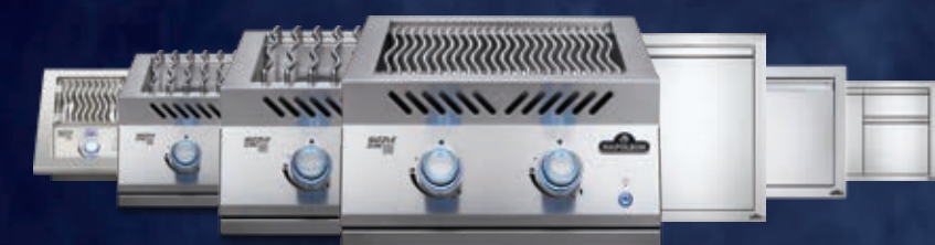
WITH ALL NEW Drop-In Burners, Zero Clearance Liners, Doors and Drawers