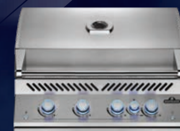
32" with Infrared Rear Burner