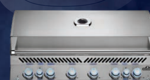
44" with Dual Infrared Rear Burners