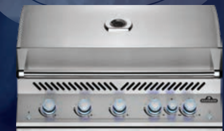
38" with Infrared Rear Burner