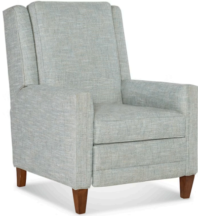
Fabric shown: 100267-32 Finish: New Classiques