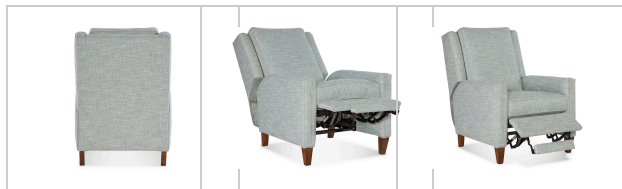
Fabric shown: 100267-32 Finish: New Classiques