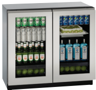
INTEGRATED FRAME (STAINLESS HANDLELESS PANEL)*