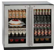
STAINLESS FRAME (LOCK)