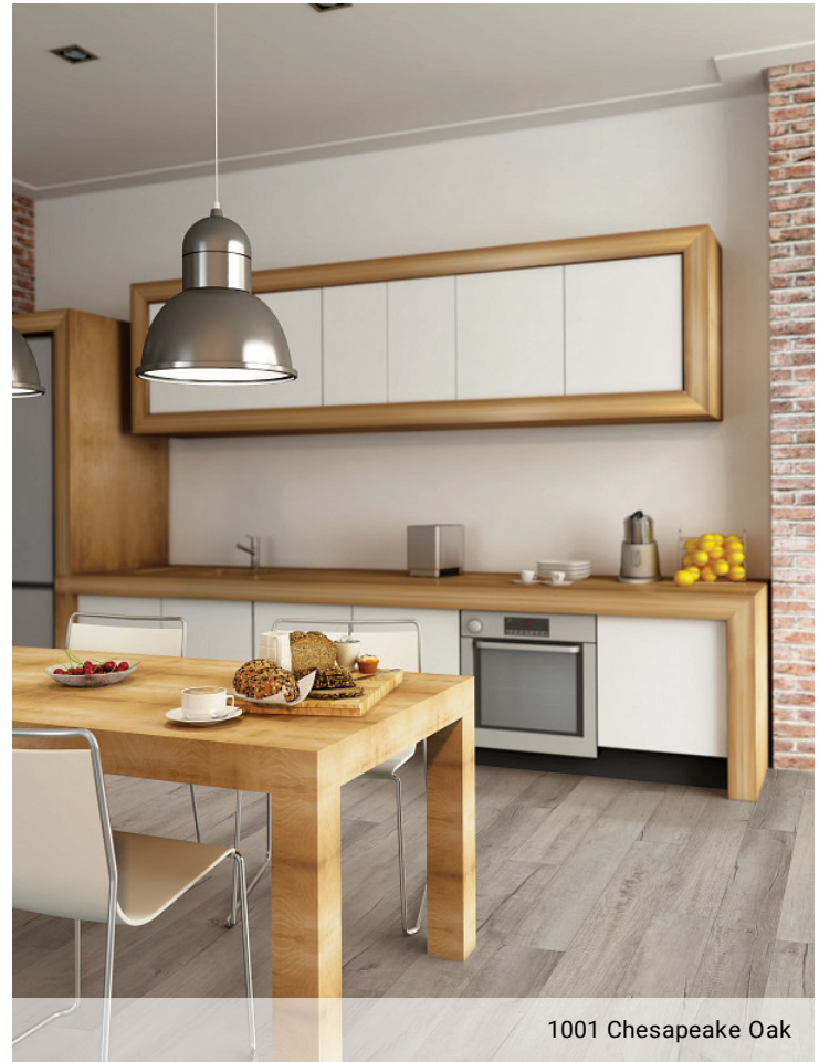
1001 Chesapeake Oak