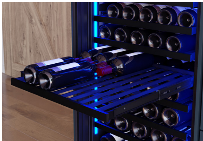
Full-Extension Wood Racks