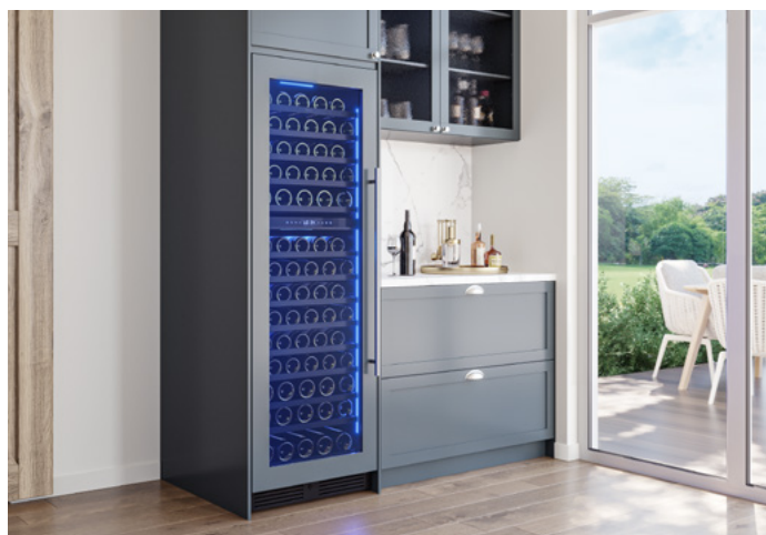
Accommodates custom wood overlay panels