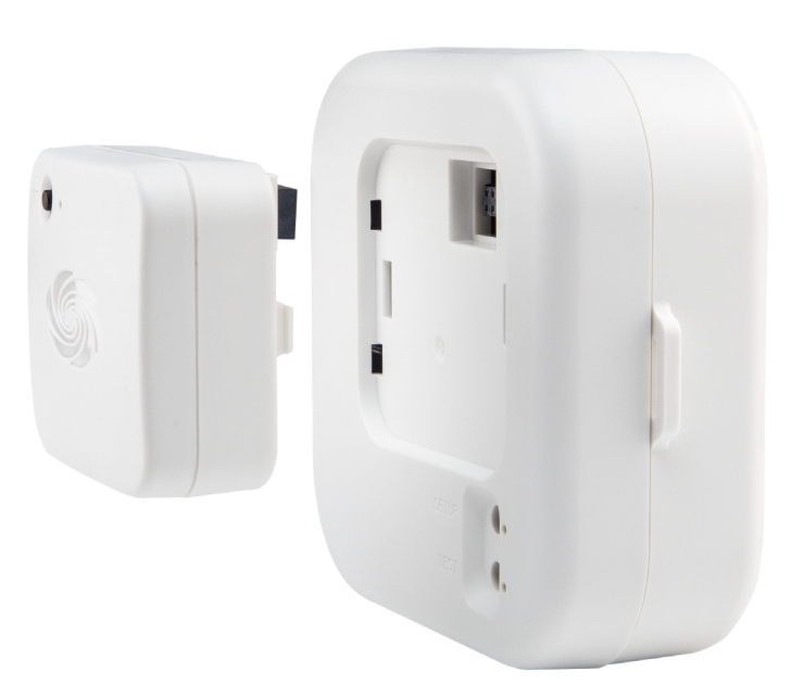
Zūm J-Box Load Controller (Right) Shown with Optional Zūm Network Bridge (Left)

Zūm delivers cutting-edge wireless lighting control and heightened energy