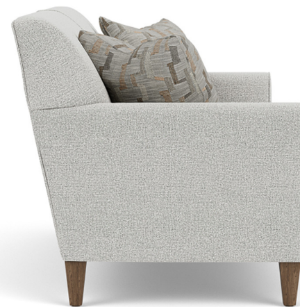
5966-30 in Fabric 962-01