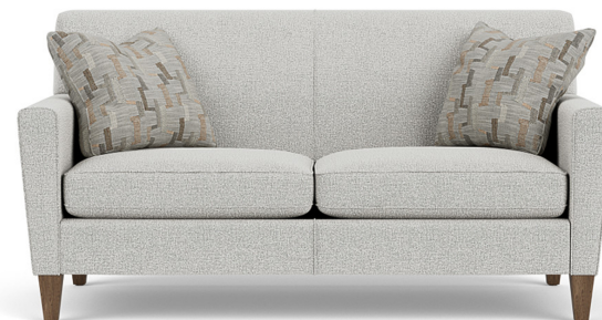
5966-30 in Fabric 962-01