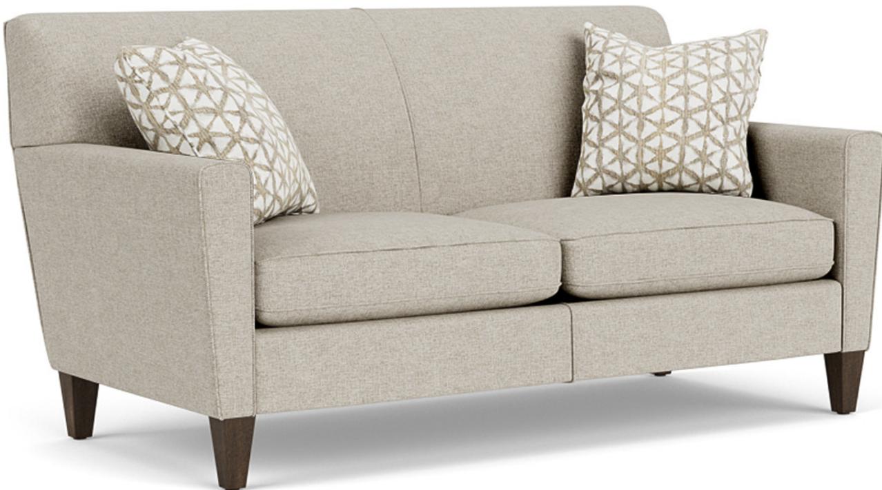
5966-30 in Fabric 818-01