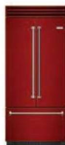
36" French Door