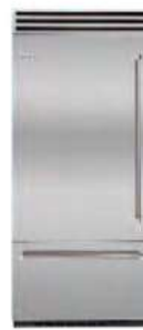
36" Single Door