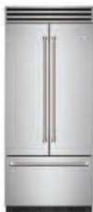
36" French Door

Customize with 1,000+ colors and finishes, 10 metal trims, and door swings.