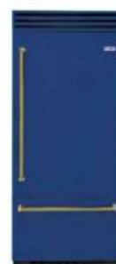
36" Single Door