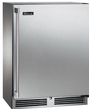
Solid Door Model