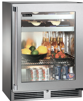
Glass Door Model