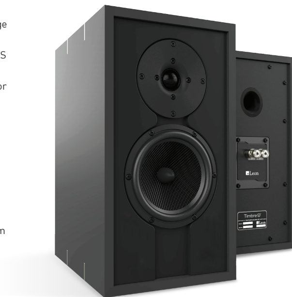
Any Custom Paint Color