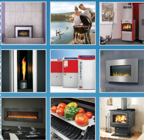
Fireplace Inserts • Charcoal Grills • Hybrid Furnaces • Outdoor Fireplaces Gas Furnaces • Gas Fireplaces • Electric Fireplaces • Accessories • Wood Stoves