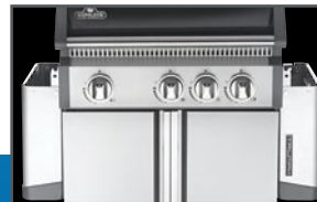
Folding Side Shelves