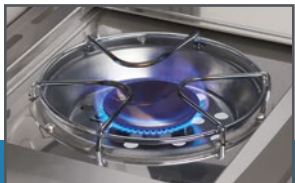
Range Side Burner