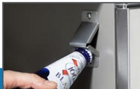
Integrated Bottle Opener