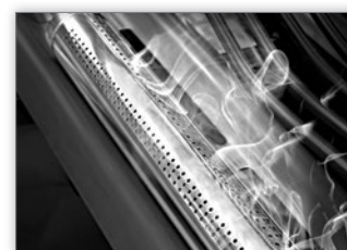
Smoker Pipe 67011