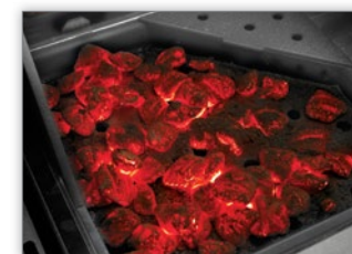
Charcoal Smoker Tray 67731