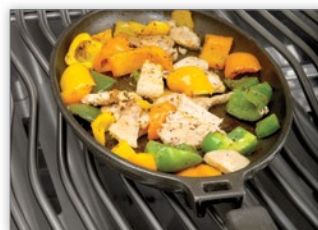
Professional Cast Iron Skillet 56003