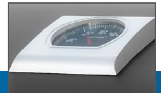
ACCU-PROBE™ Temperature Gauge