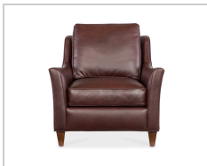
Leather shown: 927400-58