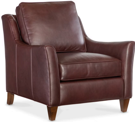
Leather shown: 927400-58 Finish shown: New Classiques