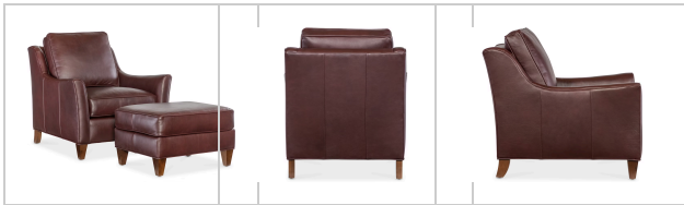
Leather shown: 927400-58

Trim: Standard Nailhead Trim #9 in Natural Finish. Other decorative nailhead finishes available at no additional cost.