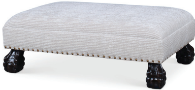
STD HEIGHT 17.5"