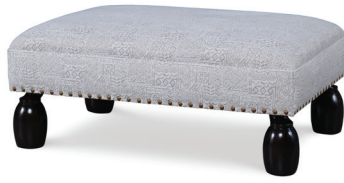
STD HEIGHT 17.5"