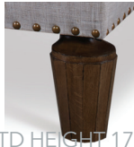
STD HEIGHT 17.5"