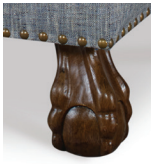
#30 - CLAW

3 SELECT YOUR DESIRED LEG (3 Options at No Charge):