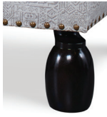
#31 - ROUND