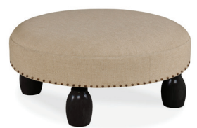
SEAT HEIGHT 17.5"