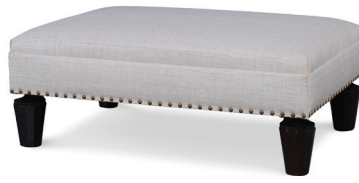
STD HEIGHT 17.5"