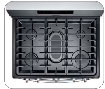
Five Burner Cooktop