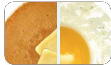
Custom Stovetop Griddle