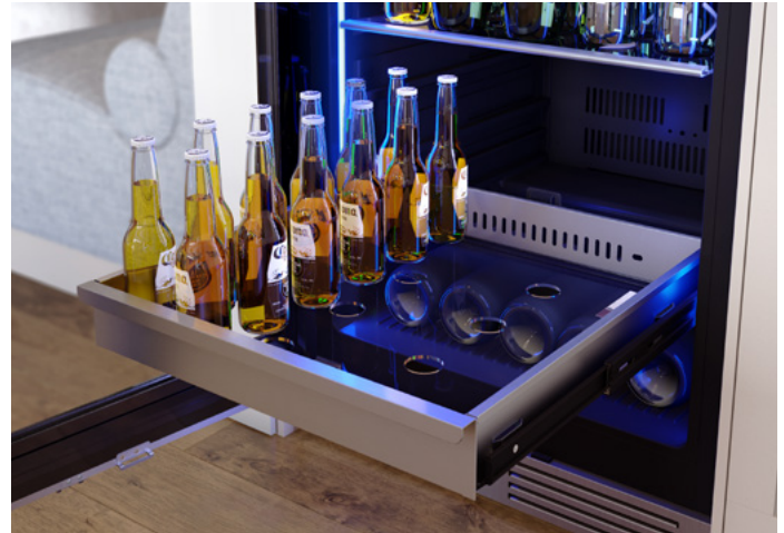
Full-Extension Stainless Steel Rollout Bin with Transparent-Gray Glass