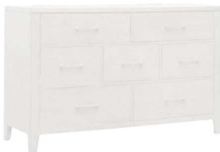
Essex Dresser S770DJ-010