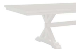
Denman Trestle Table S762DJ-131

See an error on this page? Please report it so that we may correct it.