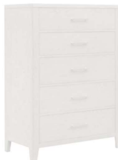
Essex Chest S770DJ-040