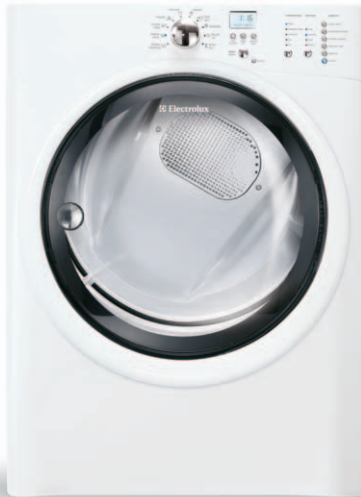
Island White EIED50L IW