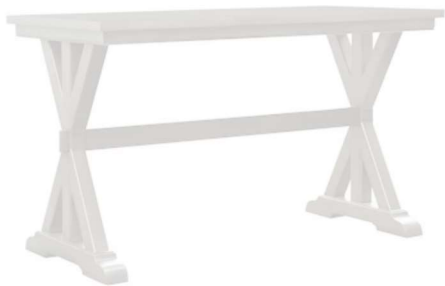
Denman Bar Height Trestle Table S762DJ-136