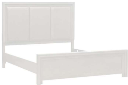
Denman King Panel Bed S762-BR-K3