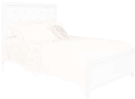
Bella White Twin Panel Bed S458-YBR-K1