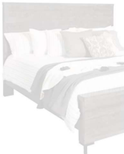
Austin Queen Panel S826-BR-K1