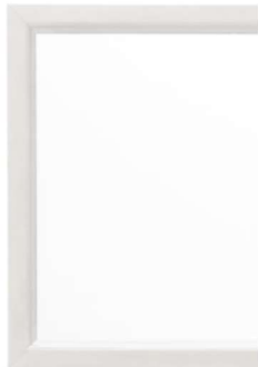
Denman Mirror S762DJ-030