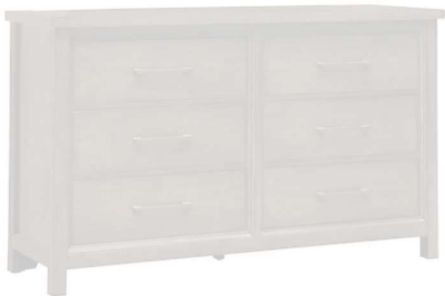
Denman Dresser S762DJ-010