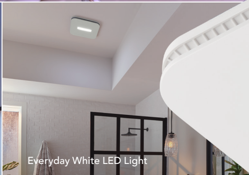
Everyday White LED Light