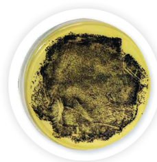
Without SurfaceShield™ Bacteria colonies grow

In your beautiful new home, the SurfaceShield™ Antimicrobial Exhaust Fan will make ventilation—and sanitization—a breeze. Broan-NuTone.com