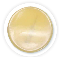
With SurfaceShield™ No visible bacteria colonies