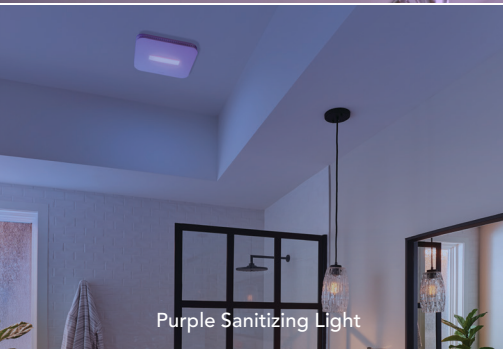
Purple Sanitizing Light