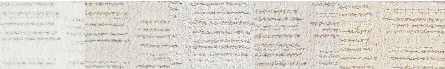
100 Purity 101 Calm 102 Atmospheric 103 Delicate 104 Awaken