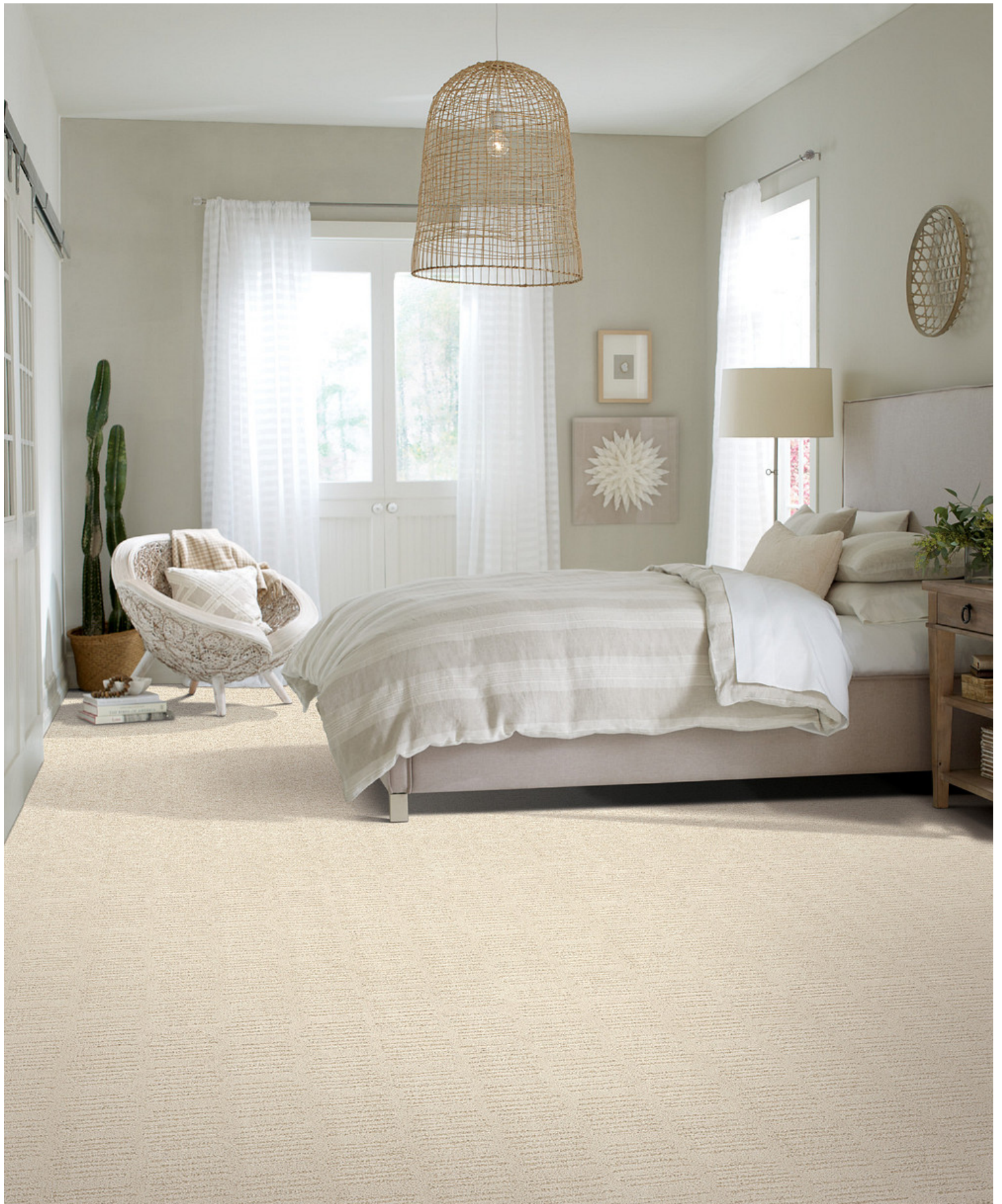
107 Soft Spoken