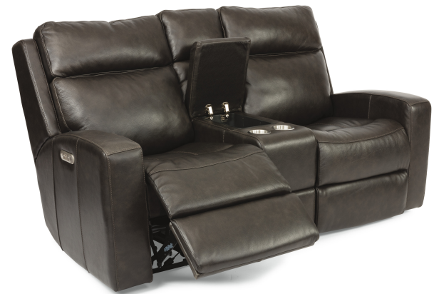
1820-64PH in 297-02