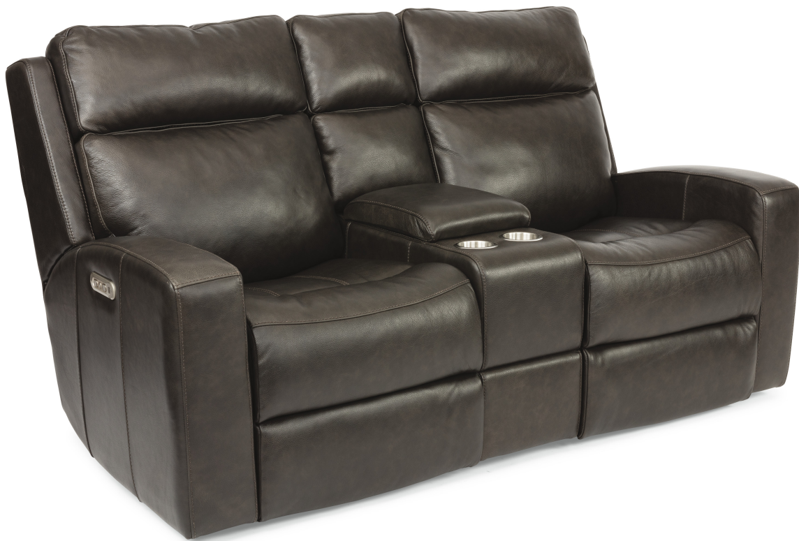
1820-64PH in 297-02