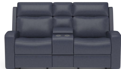
1820-64PH in Leather 297-40