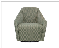
Fabric shown: MT017-23 Pavia Eucalyptus