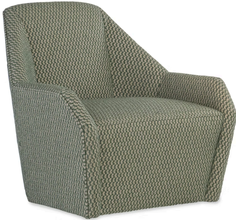
Fabric shown: MT017-23 Pavia Eucalyptus