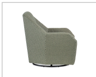
Fabric shown: MT017-23 Pavia Eucalyptus