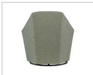
Fabric shown: MT017-23 Pavia Eucalyptus

Frame Construction: Our M upholstered furniture collection pieces are benchmade from sustainably sourced wood and upholstered start to finish by our skilled craftspeople in both North Carolina and Virginia. Every piece has been thoughtfully designed for today's modern lifestyle. Frames are constructed of sustainably certified kiln dried engineered hardwood. Frame parts are joined with precision cut interlocking joints that are glued, stapled to reduce movement, twisting and warping. Frames have cornerblocks that are glued and