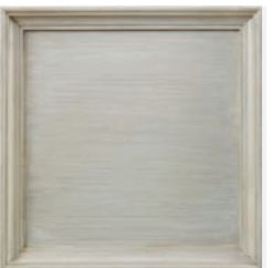
F6: Sea Glass (L) Strie finish generated by a hand-brushing technique. Creamy white texture over pale iridescent, seafoam green-cast undertones.