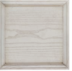
R5: Gardenia White (M) A soft alabaster tone with subtle graining to accent the natural beauty of the wood.