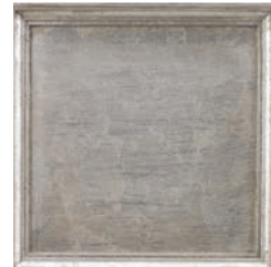
PL: Platinum Leaf (L) A true leafing process, silver leaf sheets are hand applied to the wood frame, cured and glazed over.