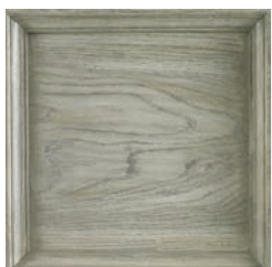
N6: Earth Grey (L) Casual light grey hues with a dry antique vintage character.