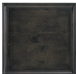
C3: Malabar (M) A wonderfully soft black finish with brown undertones.