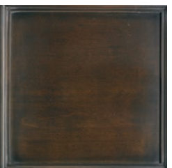
LS: Tudor (L) A deep, dark brown finish very common to Tudor styling with very little color variation providing a strong traditional feel.