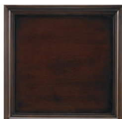
20: Maison (H) A rich hand-rubbed waxed dark walnut high sheen finish enhanced with hand burnished edges, cow tailing, and a light antique spatter.