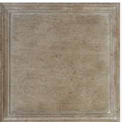
J3: Washed Canvas (L)* Has a white filler intended to hang up in the grain, then sealed, dry-brushed, visually distressed, and finished with three coats of lacquer. *AVAILABLE ON ASH & OAK ITEMS ONLY.