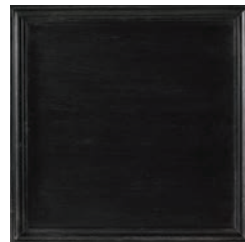
Q7: Midnight (H) An ebonized blackened paint with finely brushed grey metallic accents.