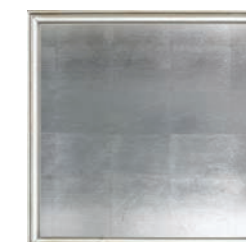
SS: Silver Leaf Squares Paintstakingly applied by hand in a grid pattern with very subtle black highlighting.