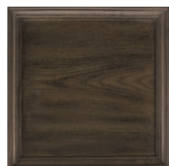
A2: Modern Elm (H) Developed to take advantage of elm veneer grain patterns, this warm greyish-brown high sheen creates a soft, transitional look.