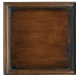
LC: Antique Walnut (M) A rich clear, dark brown finish with reddish undertones reminiscent of the color of a dark acorn.