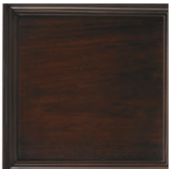
65: Walnut (H) A sophisticated high sheen finished walnut brown with russet undertones enhancing the natural beauty of wood.