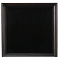
53: Sable (H) A rich dark brown high sheen finish with excellent clarity.