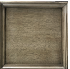
E4: Smoke (L) Warm, medium grey finish with brown undertones and light dry-brush aging around the edges allowing grain to show.