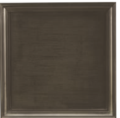
39: Black Nickel (H) A deep nickel-colored paint finish with very fine black brushing on top and a high sheen to resemble black nickel metal.