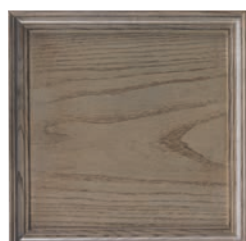
35: Smoked Ash (H) Semi-opaque greige finish.