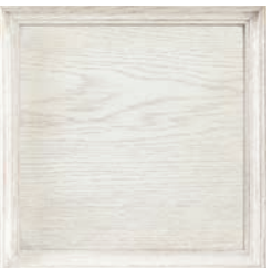
P6: Sandstone (L) A casual lighter hue, whitewashed canvas effect. The depth of the finish is subtle and crafted with character.