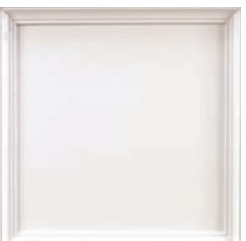
27: Sugar (L) An opaque, clean white finish with a very slight intermittent rub-through along the perimeter edge.