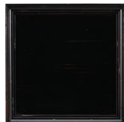
44: Ebony (M) A rich rubbed-through black finish that highlights the underlying wood tones with a lustrous satin-like patina.