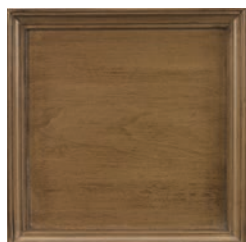
31: Driftwood (L) A neutrally aged pecan toned finish enhanced with a bleached grey-beige overtone to characterize a weathered antique.