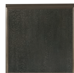
BZ: Bronze Patina A very organic, variegated finish comprised of browns and grays reflecting an acid-washed surface.