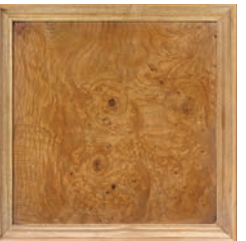
P7: Champagne (H) Mid-tone sophisticated tan hues designed to enhance the character of the veneer. Hand rubbed to create a vintage character.