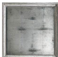
ML: Black Pearl (Metal Leaf) Silver leaf squares that are heavily worn-through, over top of a high gloss black paint background.