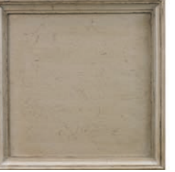
21: Dove (L) A soft patinated Belgian grey finish, burnished and detailed with a gently spattered antique glaze.