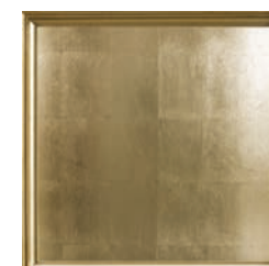
GS: Gold Leaf Squares Paintstakingly applied by hand in a grid pattern with very subtle black highlighting.