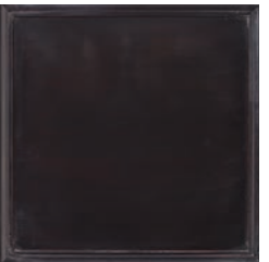
Q1: Black Tie Lacquer (H) A multi-step blending of slightly textured black lacquered tones with subtle sienna undertones.