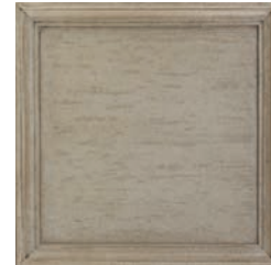
J2: Pebble Beach (L) Labor intensive finish with an emulsion creatively applied, wash coated, glazed, dry brushed and re-glazed.