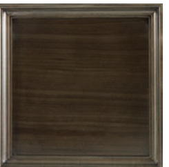
P3: Smoked Walnut (H) Natural clarity of the wood is enhanced with a darkened stain.