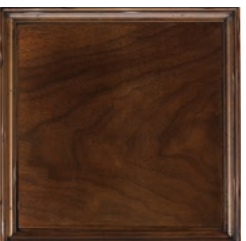
54: Soho (H) A rich, medium value, clear brown finish reminiscent of a lightly burnished antique pecan with a high sheen level.