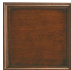
42: Cognac (H) Rich medium brown earth tones accentuate this high sheen finish with depth and satiny sheen.