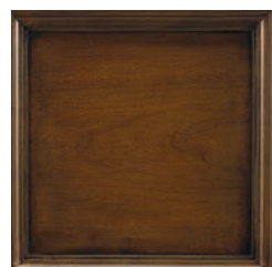
13: Lancaster (H) Medium brown high sheen finish with hand applied burnishing reminiscent of a well cared for 19th century antique.