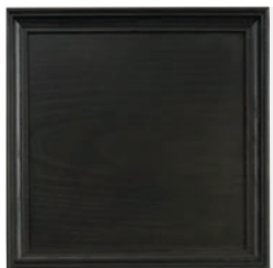
B4: Charbrown (L) With undertones of black that is first applied to fill in the graining, Charbrown is a deep, dark chestnut with a clear view to the wood.