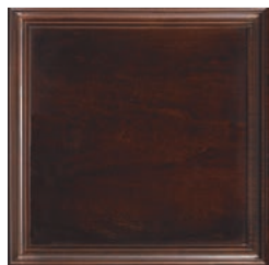
C7: Cashmere (H) The warmth and elegance of this high-sheen dark walnut finish adds a touch of class and refinement to any item.