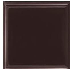
C8: Café Noir (H) The color of rich, dark Colombian coffee, a beautifully sleek, very dark brown/black finish with a high sheen.