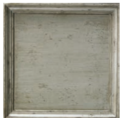
E5: French Blue (L) Aged like a fine vintage Court piece, this is a beautiful grey-blue paint with hints of silver, dry-brushing and glazing.