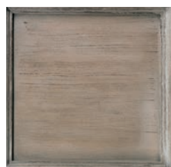
LR: Slate (L) A multi-step finish starting with a medium brown finish, then overlaid with a grey-beige secondary finish.