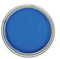
CM: Color Match (M) Select any brand name paint color and we will Color Match it on your order; include name, number, and color chip with order.