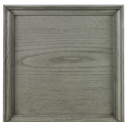
J7: Mineral (L) Grey stained finish with some translucence which accentuates the wood character of the item.