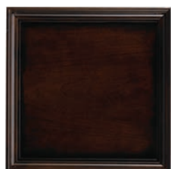
O7: Newport (H) An elegant clear medium brown high sheen finish with very light aging and subtle burnishing of a well cared for antique.