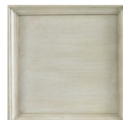
H2: Sancere (L) A warm, creamy ivory painted finish with a very light brush-stroke glaze applied over the top.