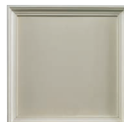
N5: Savoy White Lacquer (H) High gloss white lacquer, clean modern character.