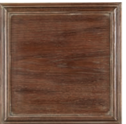
R8: Beretta Brown (L) A rich cocoa brown with toffee highlights and silver/gold hangup.