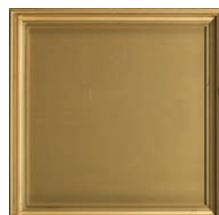
F4: Gold (L) A gold paint with a glazed appearance to emulate the beauty and appearance of gold leafing.