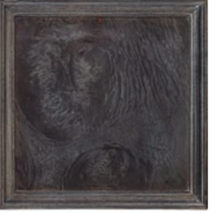
P9: India Ink (H) Dyed navy teal hues that are hand rubbed to enhance the natural beauty of the veneer.