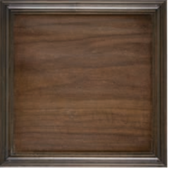
R6: Esquestrian Brown (M) A rich espresso finish with subtle highlights. The color provides an aged yet sophisticated look.