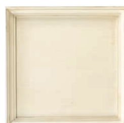
34: Washed Linen (L) Clean, off-white finish with a very light rub through providing the natural look of washed cotton or flax.