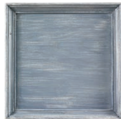
Q5: Ipanema Beach (L) Cerused blending of white and soft blue tones creating a vintage antique character.