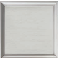
M3: Silver Fox (H) Metallic silver color that is very refined allowing for translucence to showcase the natural beauty of the wood.