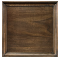
M2: Carob Brown (L) A low sheen, warm brown finish, that enhances Walnut's beautiful grain and warm tonal ranges.