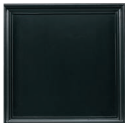
48: Espresso (M) Deep rich black traditional finish with deep luster that has a very light rub-through along the perimeter edge.