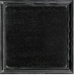
N2: Dark Chocolate Cerused (L)** Accentuated with white cerusing. Light sandblasting enhances the wood grain. **AVAILABLE ON ASH & OAK SANDBLASTED ITEMS ONLY.