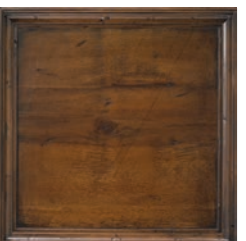
C1: Vintage Brown (M) A warm, deep chestnut brown finish with hand applied dry-brushing and shading to create the look of a much loved well worn vintage piece.