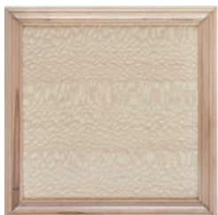
R7: French Pearl (M) Subtle pearled finish on a highly figured lacewood veneer. **AVAILABLE ON LACEWOOD ITEMS ONLY