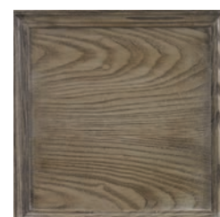
A5: Smoke Ash Sandblasted (L)** Semi-opaque grey finish with grain character highlighted through sand blasting technique to create wood character. **AVAILABLE ON ASH & OAK SANDBLASTED ITEMS ONLY.