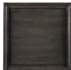
J8: Cinder (L) A very clear medium-brown finish with hints of dusky grey beneath the surface providing an almost iridescent affect.