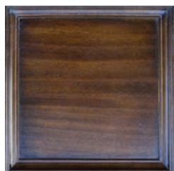
G1: Cotswold (H) A deep clear brown finish with medium-high sheen level as apt for a formal traditional or urban high end contemporary look.