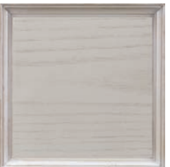
Q6: Wishbone (L) Subtle cerusing in this off white palette creates a casual inviting feel.