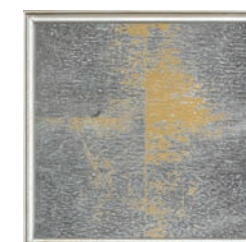
SG: Silver Leaf with Gold Created by applying gold painted ground color, hand-applying silver leaf sheets in a grid pattern, then wearing the edges.