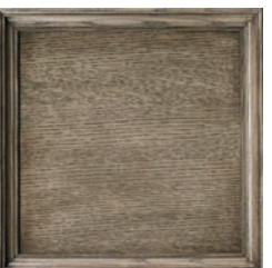
N1: Vintage Grey (M)** Casual semi-opaque grey finish with grain character highlighted through sandblasting. **AVAILABLE ON ASH & OAK SANDBLASTED ITEMS ONLY.