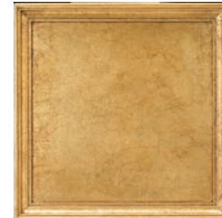
GL: Gold Leaf (L) A true hand-leafed finish; sheets of gold leaf hand-applied, cured, then glazed over.