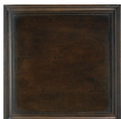
J1: Palmero (M) Rich, clear medium brown finish with deep luster and subtle cow-tailing and fly-specking distressing