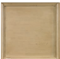
16: Silkwood (L) A very artistic tawny beige finish that has been very lightly spattered with moderate read-through to the wood grain.