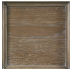
Q4: River Rock Cerused (L) A casual mid-tone soft brown palette, accented with cerusing. **AVAILABLE ON ASH & OAK SANDBLASTED ITEMS ONLY.