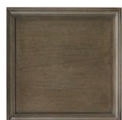
79: Stone (L) Very clean grey-beige finish that reads through to the beauty of the wood grain beneath.