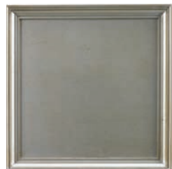
O3: Platinum (M) A metallic finish with an underlying base of silver and very subtle hand-padded gold overtones giving a platinum patina