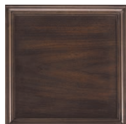
A1: Modern Walnut (H) A rich, warm, high sheen brown finish that emphasizes the clarity and natural beauty of the wood.