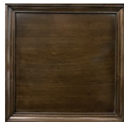
R9: Ember (H) A clear medium brown finish with a slight grey undertone enhancing the natural beauty of the wood.