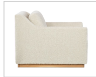
Fabric shown: MB014-04 Bryan Parchment Finish: Natural Oak