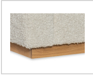
Fabric shown: MB014-04 Bryan Parchment Finish: Natural Oak