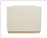
Fabric shown: MB014-04 Bryan Parchment Finish: Natural Oak