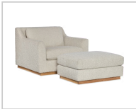
Fabric shown: MB014-04 Bryan Parchment Finish: Natural Oak