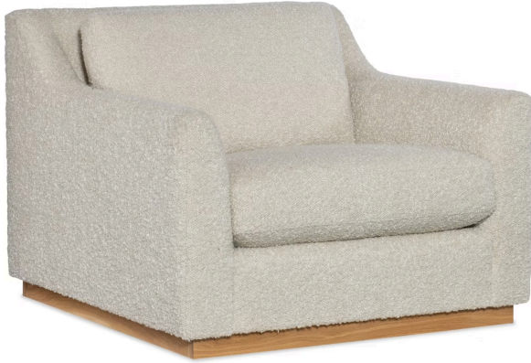
Fabric shown: MB014-04 Bryan Parchment Finish: Natural Oak

Frame Construction: Our M upholstered furniture collection pieces are benchmade from sustainably sourced wood and upholstered start to finish by our