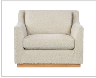
Fabric shown: MB014-04 Bryan Parchment Finish: Natural Oak