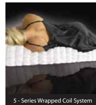
5 - Series Wrapped Coil System

Adjustable Base & BodyLogic™ Lifestyle friendly