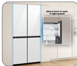
Zero clearance fit