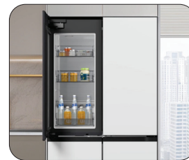
Food Showcase Door