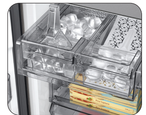
Dual Ice Maker with Cubed Ice & Sphere Ice