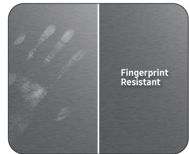
Fingerprint Resistant Finish