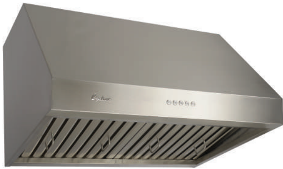
30" Stainless Steel