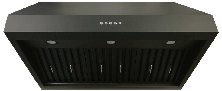
36" Matte Black