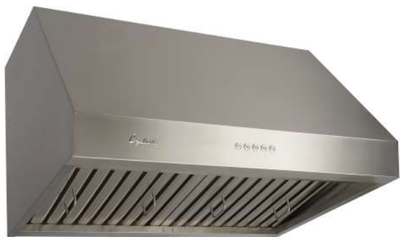
30" Stainless Steel