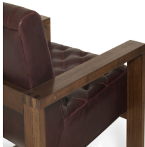
TIGHT BACK CUSHIONS WITH MEMORY FOAM