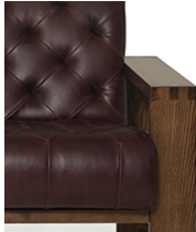
PREMIUM ELASTIC WEBBING