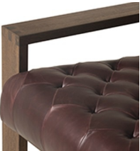
HIGH RESILIENCY FOAM SEATING