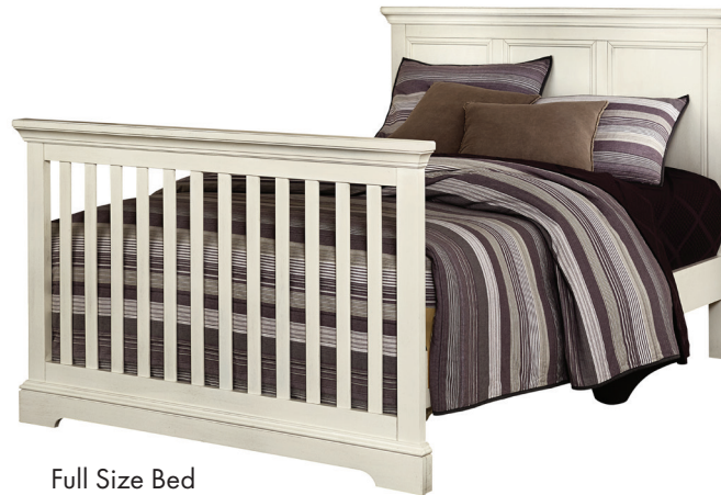
Full Size Bed