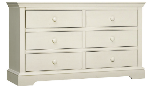
Six Drawer Dresser