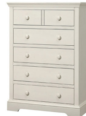
5 Drawer Chest