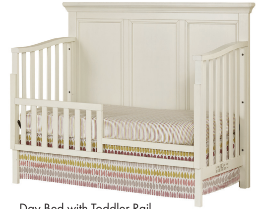
Day Bed with Toddler Rail