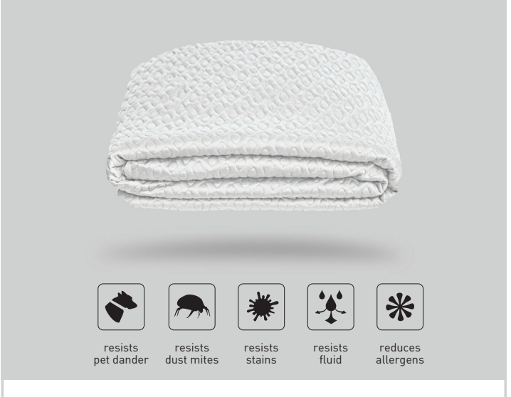
Ver-Tex® Performance® Mattress Protector includes a noiseless waterproof barrier that reduces buildup of pet dander, dust mites and allergens to the bed.