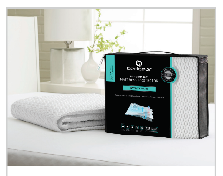
Ver-Tex® Performance® Mattress Protector is designed in a lofted marquee-diamond pattern.

Ver-Tex® Performance® Mattress Protector is engineered with BEDGEAR's instant-cooling Ver-Tex® fabric technology that reduces sweat and heat buildup to create an ideal sleep environment. Designed in a lofted marquee-diamond pattern, this mattress protector has soft, breathable layers that enhance airflow for maximum comfort throughout the night.