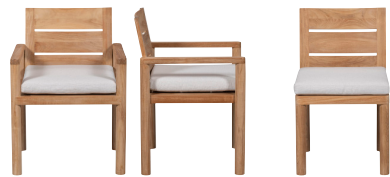
Horizon Dining Arm Chair OV100A (shown left) W 24 D 23.5 H 33.25 Arm: H 25 Horizon Dining Side Chair OV100S (shown right) W 19.5 D 23.5 H 33.25 Natural Teak. Also Available without Cushion: OV101A, OV101S