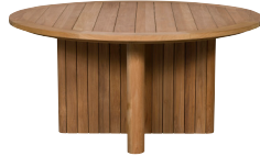
Horizon Round Dining Table O298T2 W 60 D 60 H 29.25 Natural Teak.