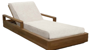
Horizon Chaise Lounge OV100-CL W 35 D 80.5 H 35 Natural Teak, Adjustable Back. Rendering shown.