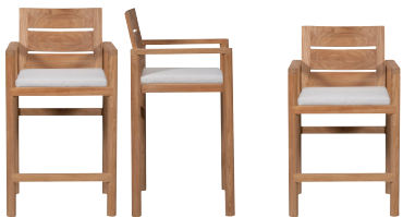
Horizon Bar Stool OV100-BS (shown left) W 24 D 23.5 H 42 Horizon Counter Stool OV100-CS (shown right) W 24 D 23.5 H 36 Natural Teak. Also Available without Cushion: OV101-BS, OV101-CS

HOW TO CARE FOR YOUR OUTDOOR FURNITURE Once the weathering of the finish begins, we recommend the following: Hose down the furniture (DO NOT use a power washer) and clean with Golden Care® Hardwood & Teak Cleaner using a sponge or soft scrub brush to remove dirt and loose paint, ensuring a clean surface. Allow the surface to dry for 24 hours. If exposure to moisture over time has raised the wood grain, sand lightly with 120-grit sandpaper. Apply Golden Care® Instant Grey to maintain the color of your finish. Allow to air dry for 24 hours. Apply Golden Care® Hardwood & Teak Shield to protect from UV rays, mold and mildew, and food and drink stains. RECOMMENDATIONS: Avoid letting water stand on the surface of furniture and cushions. Do not allow wet cushions to sit on a frame for extended periods of time, as trapped moisture will contribute to the deterioration of the finish. We recommend using furniture covers for teak items when not in use; furniture cushions and covers should be clean and dry before covering. Cushions should be removed - whenever possible - before covering the frames for longer than a few days to avoid mold and mildew build-up. If cushions get wet, tip them on their sides with the zipper facing down and unzipped to ensure that all water drains.