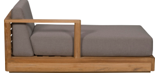
Horizon Left Arm Chaise OV100-LAH (shown) Horizon Right Arm Chaise OV100-RAH W 34 D 68 H 30.5 Natural Teak.