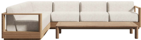
Left Arm Two Seat Loveseat OV100-LAL Left Arm Bench Seat Loveseat OV100-LL1 Right Arm Two Seat Loveseat OV100-RAL Right Arm Bench Seat Loveseat OV100-RL1 W 68 D 35 H 30.5 Rendering shown.