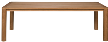
Horizon Rectangular Dining Table O298T1 W 88 D 44 H 29.25 Natural Teak.