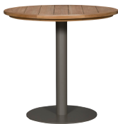
Horizon Bistro Table O298T3 W 38 D 38 H 36 Natural Teak Top, Aluminum Base.