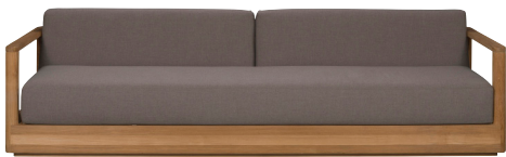
Horizon Bench Seat Sofa OV100-ES1 (shown) Horizon Two Seat Sofa OV100-ES2 Horizon Three Seat Sofa OV100-ES W 108 D 35 H 30.5 Natural Teak.