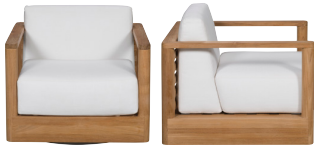
Horizon Chair OV100-CH Horizon Swivel Chair OV100-SW (shown) W 34 D 35 H 30.5 Arm: H 24.25 Horizon Ottoman OV100-OT W 29 D 29 H 18.5 Natural Teak.