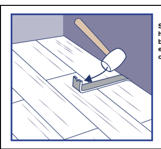
Step 9: Use hammer and pull bar to lock long edges of flooring on final row.