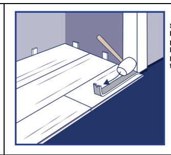
Step 2: Use hammer and pull bar to lock this piece of flooring