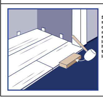
Step 1: Undercut space under door jamb to allow flooring to slide freely. Tap long edge with hammer and tapping block to lock long edge.