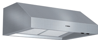
DPH30652UC Stainless Steel

Quickly and quietly clears the air of smoke and odors.