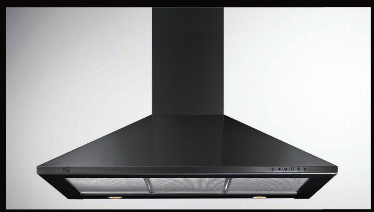
Wall Mount Hood