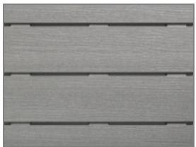
Cape Grey Rustic Polymer