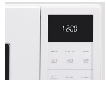
Premium White LED Display is Easy to Read