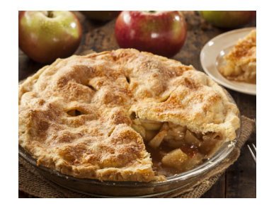
Utilize Low Mix or High Mix to Incorporate Both Convection Heat and Microwave Cooking

With decades of experience designing innovative cooking appliances, it's easy to see why home cooks throughout the world trust Sharp Carousel.