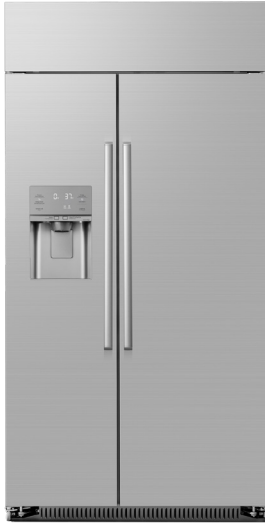
DRS425300SR/DA — Silver Stainless