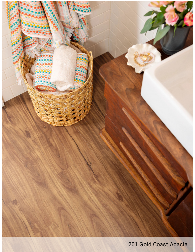
201 Gold Coast Acacia