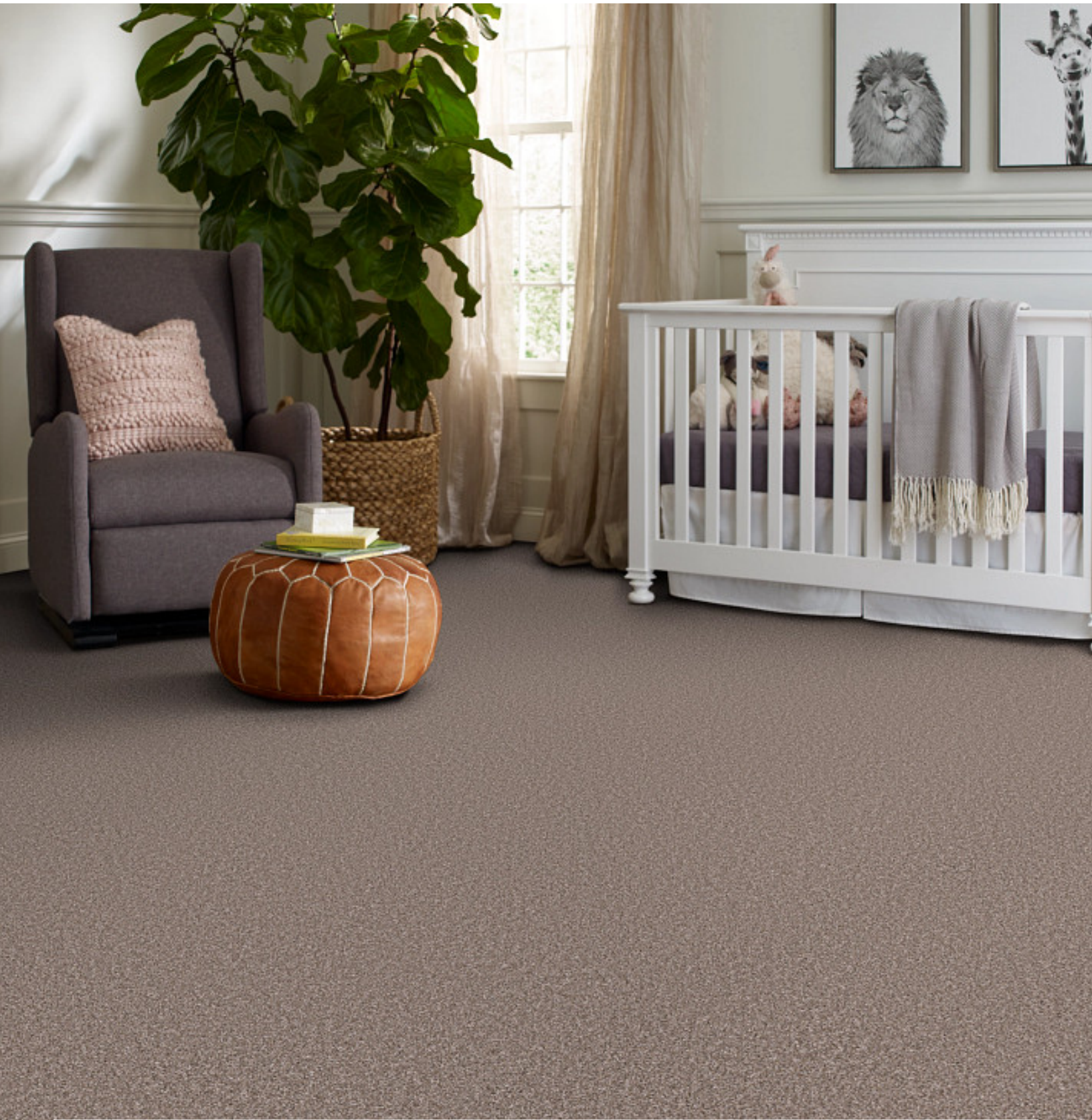
705 Taupe Dream