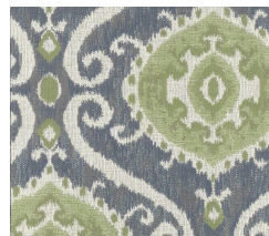
4553 Adorn in 003 Meadow