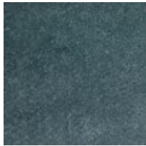
Pillow Fabric: 2-20" x 14" Pillows Front 8104-52CC, Front Ends 2153-52CC with Double Row of Trim U00415, Back 2285-52CC