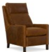
SKU L5595-05PR Nathan