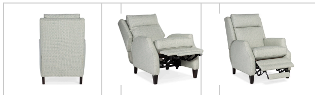
Fabric shown: 100256-35 Finish shown: Java Fabric shown: 100256-35 Finish shown: Java Fabric shown: 100256-35 Finish shown: Java