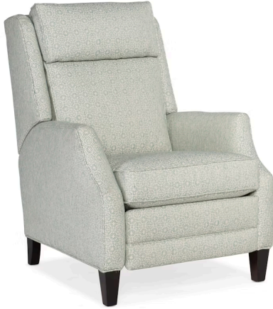
Fabric shown: 100256-35 Finish shown: Java