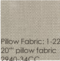
Pillow Fabric: 1-22''' x 20''' pillow fabric 2940-34CC