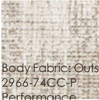
Body Fabric: Outside 2966-74CC-P Performance