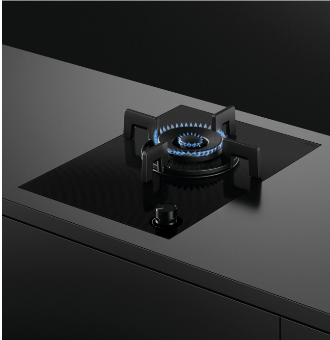
CG151DLPGB5 - 15", LPG, Black